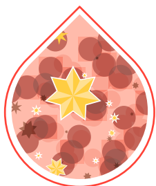
Platelets Control Bleeding

Donors now have the opportunity to make an apheresis (ay-fur-ee-sis) donation and donate just platelets, red cells, or plasma at blood drives. These individual components are vital for local patients in need.